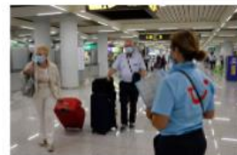
Arriving at the airport