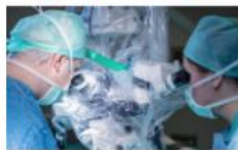
Surgeons using operating microscope