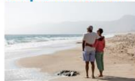
Couple on a beach