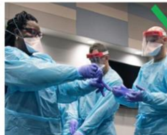
"Florida National Guard" by The National Guard is licensed under CC BY 2.0

This item is about depicting the evidence accurately (population, intervention and/or setting).