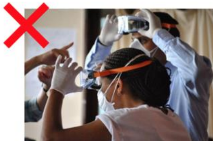
"PPE Training in Sierra Leone"

Example: Healthcare workers and infection prevention and control (IPC) for respiratory infectious diseases